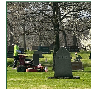
Ground System, Inc.

Their work has been aligned to the important responsibilities of mowing, trimming, and cleaning the 218-acre Ferncliff grounds. To better fulfill these needs, this seasonal work has been contracted to a qualified and professional specialty company, GroundSystems, Inc. The process of evaluation began in May 2022 and resulted in a completed contract in December. Ferncliff looks forward to this new partnership.