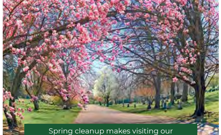
Spring cleanup makes visiting our magnolia trees even more enjoyable.

These videos are available on our website, all Ferncliff social media platforms, and YouTube. Stay tuned for Episode 3 coming soon.